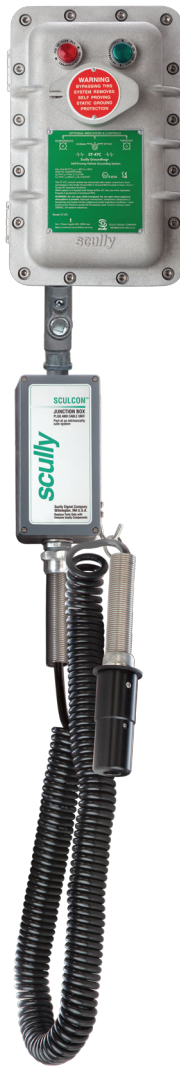
Scully Groundhog Control Monitor with Plug and Cable