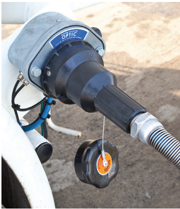
One Connection for Overfill Prevention and Earthing