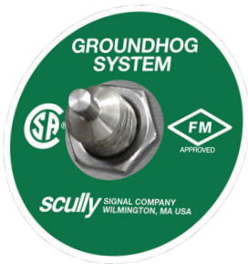
Scully Ground Bolt