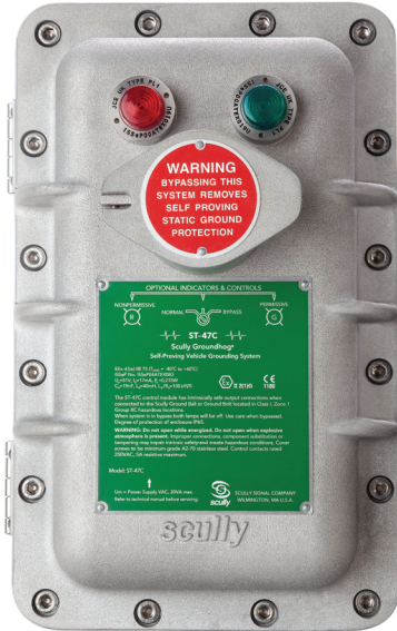
Groundhog Earthing Verification System

Featuring Dynacheck® – Automatic and Continuous Self-Checking Circuitry