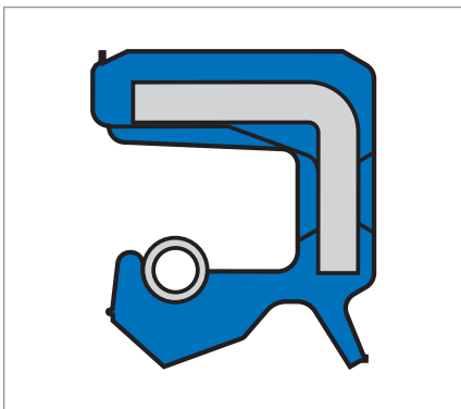
Simmerring BA ...SL