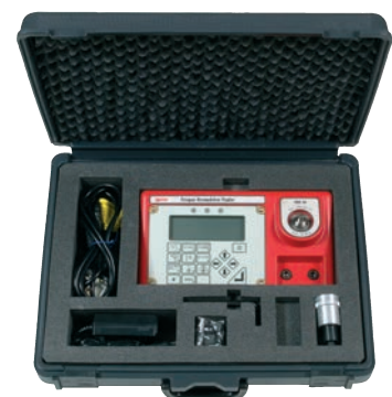
TST in standard carry case.