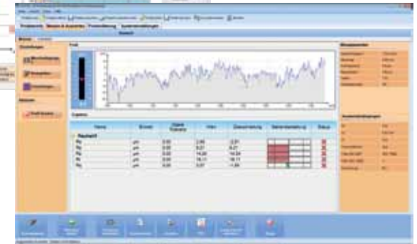
Measurement and evaluation in Online mode