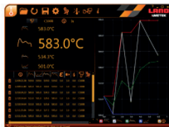
The Table View showing Instantaneous, Valley, Average and Peak, plus the unique Meltmaster temperature (on the 055 L model) readings.

The Trend View displays Peak, Instantaneous, Average and Valley temperatures, Logger settings, Route Manager, Background Correction plus Timed Logging (taking measurements at pre-defined intervals between 1 and 60 secs).