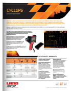
CYCLOPS LOGGER SOFTWARE

SEE OUR OTHER RELATED LITERATURE FOR THE CYCLOPS L: